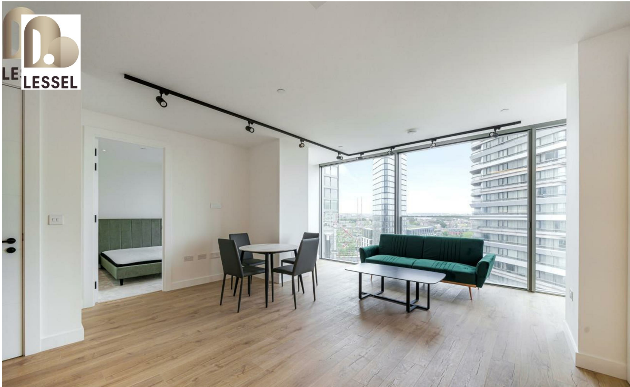
Apartment 29 Valencia Tower 3 Bollinder Place, London, EC1V 2AP £750 Per Week